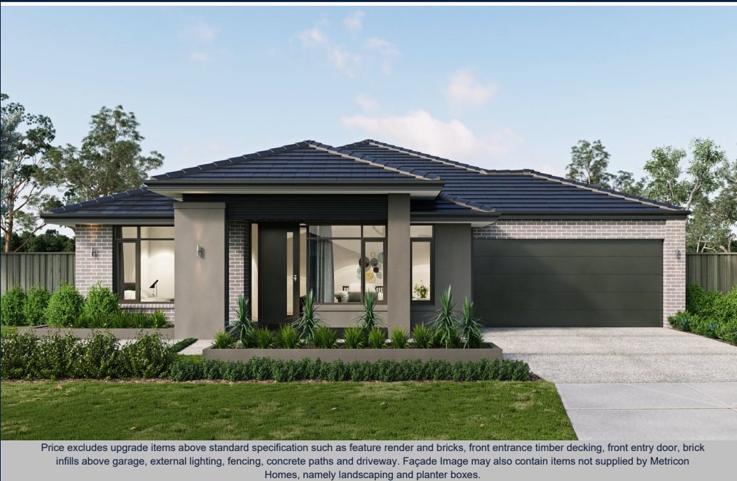
Price excludes upgrade items above standard specification such as feature render and bricks, front entrance timber decking, front entry door, brick infills above garage, external lighting, fencing, concrete paths and driveway. Façade Image may also contain items not supplied by Metricon Homes, namely landscaping and planter boxes.